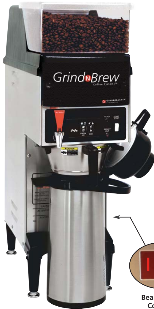
Model 10H (Airpot sold separately)