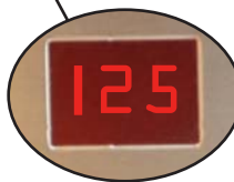
Bean Usage Counter

Digitally controlled Single Bean Grind'n Brew™ Brewer System. Brewer will maintain brew temperature to \pm 1^\circ\text{F} throughout brew cycle. Brew temperature, brew volume (full and half batch), grind portions (full and half batch), operator defined pre-infusion/pulse brewing, energy savings and Low Temp/No Brew are programmable from the front display.